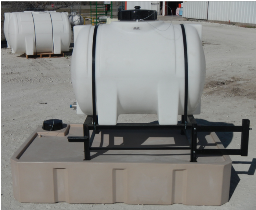
Shown with optional solar pole bracket